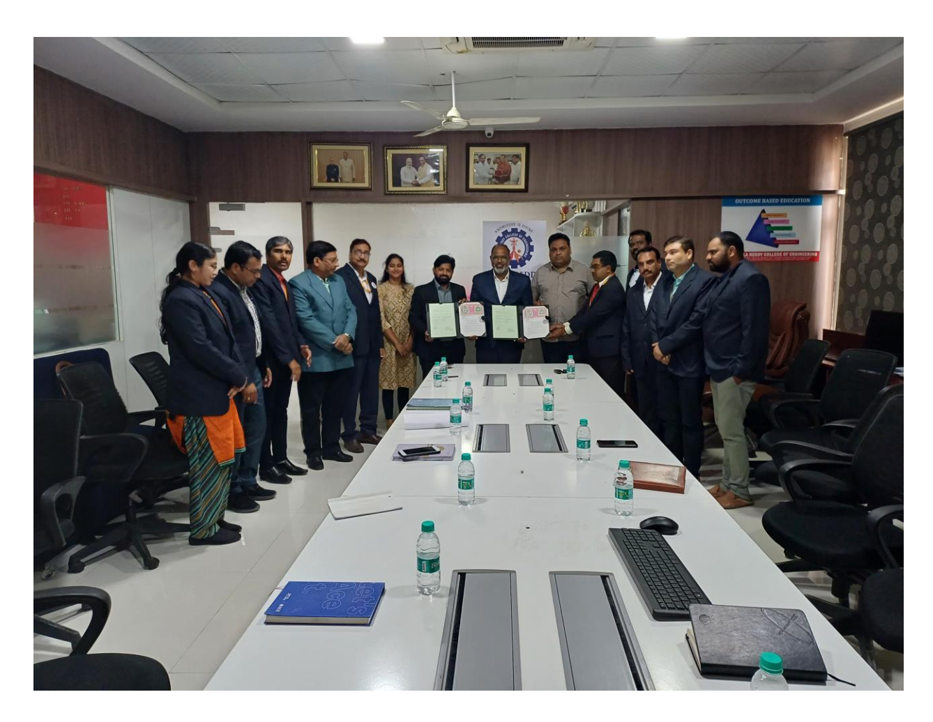
MoU signed at 11 AM @ BOARD ROOM ,MRCE